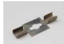
Surface mount clip